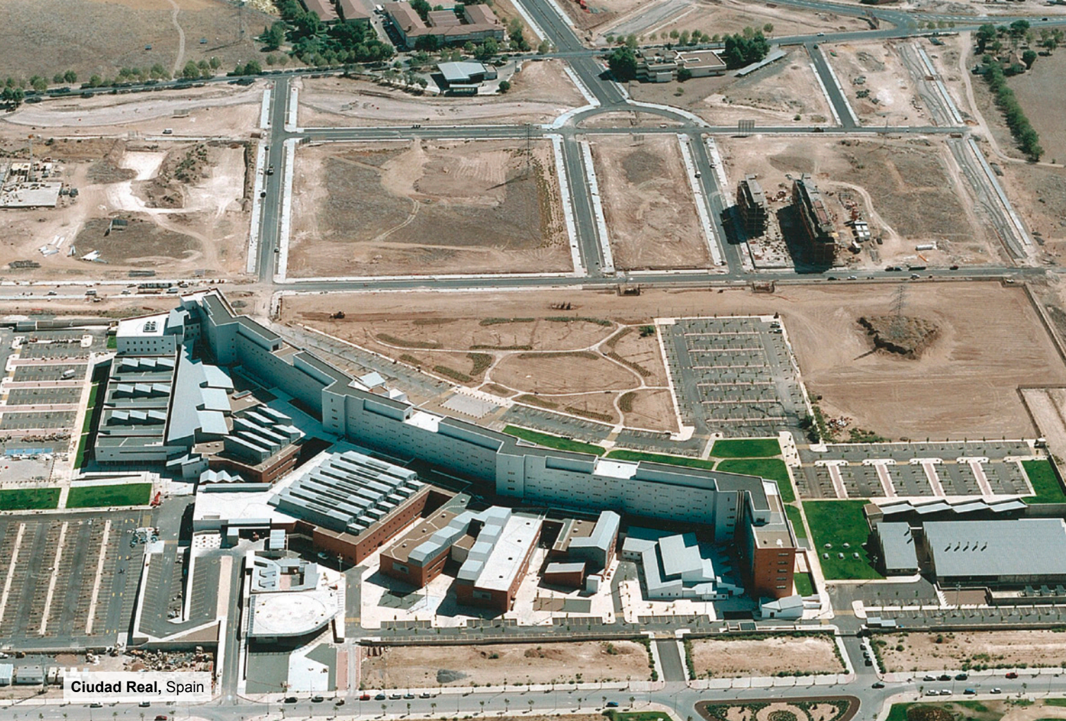
Ciudad Real, Spain